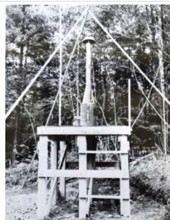
Figure 2: The 10,000-Ci ^{137}\text{Cs} radiation source in position in site 1.

All infrastructure, field and laboratory measurements, animal trapping, climatological data, etc. were analyzed and presented. In table below, it shows the predicted results of what would be the response of the woody plants, herbaceous species and lichens (Table 1).