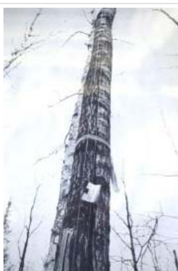
Figure 5: Two TLDs attached to trees.