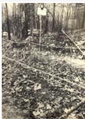
Figure 4: Ground-plot TLDs attached to bamboo stakes.