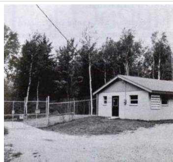
Figure 3: Control building, entrance gate and fence.