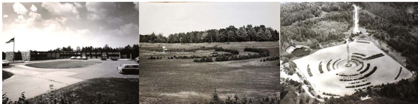
Figure 1: Study site on the Oneida County forest lands in Enterprise.

which is like x-radiation, just a much shorter wave length. There is no residual radiation after exposure or source removal. The source and guide tube were placed on a well constructed wood stand about 6 feet above ground as seen in the below photo (Figures 2,3).